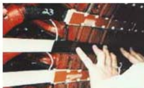
Stator Slot Coupler Installation

The SSCs are connected with micro-coaxial cables to an external termination box. Hydrogen-cooled turbine generators are fitted with gas-tight connectors, or a standard Iris penetration.