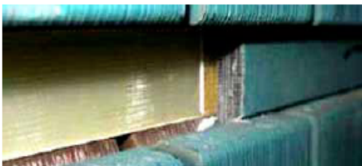
Figure 3. Incorrectly Installed Wedges

Company: Midwest US Utility Ratings: 173 MW, 18 kV, Hydrogen Cooled Turbine Generator, 3 years in operation