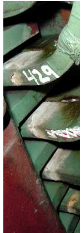
Figure 2. Grading Area Damage →

Excerpt from paper “Partial Discharge Measurements on Hydro Generator Stator Windings Case Studies”, by S. Li and M. Chow” in IRMC June 2006